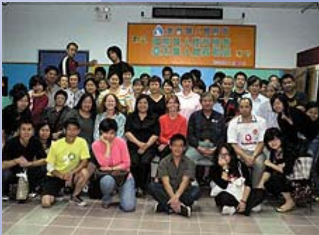
Group photo in Macau