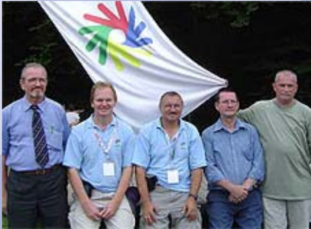
World Deaf Orienteering Championships