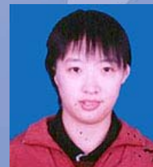
Ce SHI – (CHN) Table Tennis