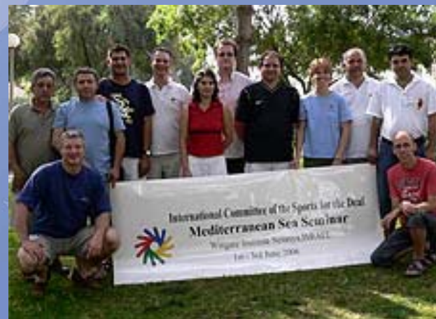
Mediterranean Sea Deaf Sports Seminar