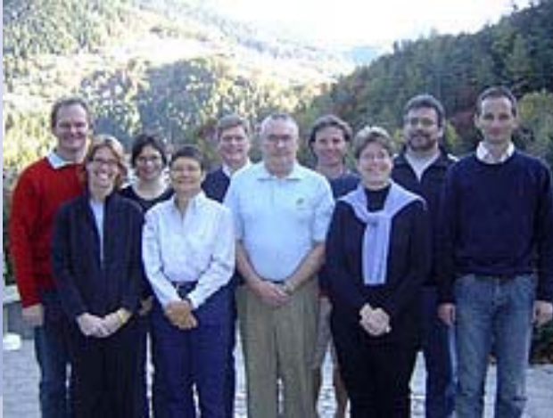
Technical meeting in Passugg, Switzerland.