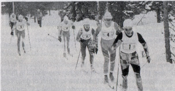
Racing for lead at a cross country event of the 13 th World Winter Games for the Deaf, Ylläs, Finland March 1995