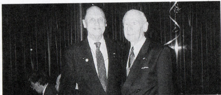
Two very important people of the CISS!

The CISS Report 1995-97 is a summary of the CISS' activities over the last two years and three months, and demonstrates the breadth and depth of our busy and successful work with deaf sports.