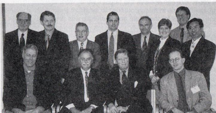
CISS Executive meeting with senior officers at Copenhagen, 21 st March 1997